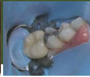
Figure 6: So we fitted the rubber dam ...