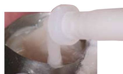
Figure 3: Though I'm now using HyperFIL, my technique is somewhat different from the one Parkell Promotes. I minimize the light-cure and I apply compression as it self-polymerizes.

In the early days I used hand-mixed chemical-cure resins and a two-material technique (that is, one material for the base with another material laminated over it.) They were a pain to mix, load into the tube and into the tooth—but the margins held up beautifully. Some of the earlier materials discolored with time—but,