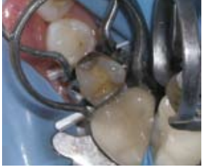
Figure 9: The bonding agent was applied and cured. (I use an etch/prime/bond system. But whatever you use, be sure to check with the supplier that it's compatible with self-cure composites. Many bonding agents are not.)