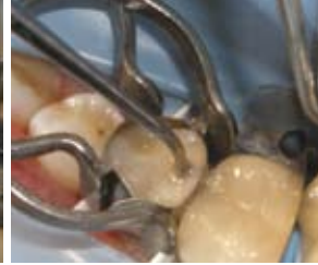
Figure 11: Instead of immediately light-curing from the occlusal, I use a large plugger to compress the material against the tooth surface. For small preps, I start with a small plugger or ball burnisher. This assures that the composite is in intimate contact with the prep and helps counteract any shrinkage.