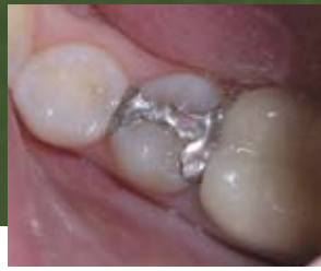
Figure 5: The amalgam MOD was failing and required replacement.