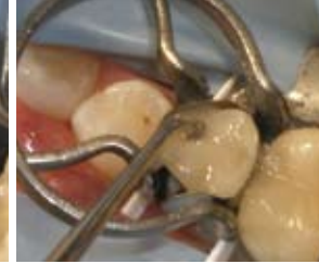
Figure 12: As the polymerizing composite develops body, I switch to a larger plugger and apply progressively more pressure.