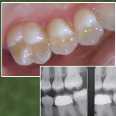
Figure 1: These three restorations (#14MO, #13MOD, #12DO) were placed in 1999 using a bulk-compression technique. The photo and radiographs were snapped at recall appointment 9-years later. Notice the tight margins.