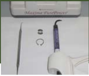
Figure 4: Here's my armamentarium.