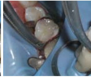
Figure 16: I remove the matrices. I always need a hemostat because the contacts are so tight.