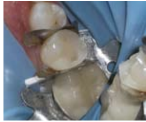
Figure 15: This creates a surface that's immediately hard.