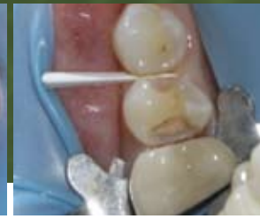
Figure 7: removed the old filling ...