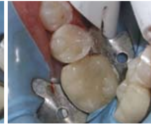
Figure 17: Here's the restoration before contouring and shaping ...