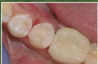
Figure 2: Placed three years ago using a core material.