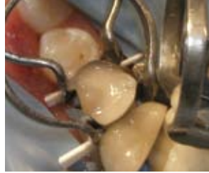
Figure 10: I overfilled the preparation with HyperFIL. Now here's where the technique differs from Parkell's instructions ...