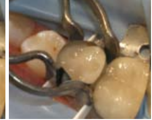
Figure 13: When the HyperFIL has set and I can no longer compress the composite, I loosen the matrices ...