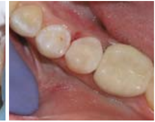
Figure 18: And after

again the margins looked great at recall, even if the shade didn't.