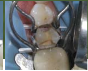
Figure 8: and applied the matrix, wedges and rings.